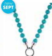
TURQUOISE long $199