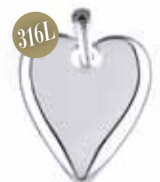
STEEL PASSION medium $129