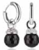
BLACK DROPS $109