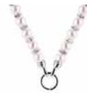
PEARL LUXE standard $209 medium $249