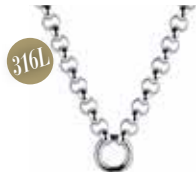
316L STEEL ME standard $179 long $249