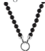
JET BLACK short $159, standard $169 medium $199, long $229