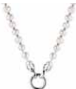
CREAM PEARL short $159 long $209