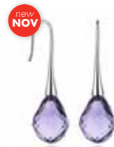
new NOV VIOLET OPERAS $99