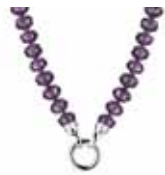
GOOSEBERRY standard $169