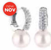
new NOV DUCHESS DROPS $129 *Cubic Zirconia