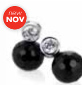
new NOV ETERNITY DROPS $109