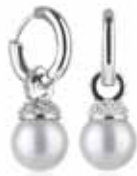
SILVER DROPS $109