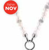
PEARL LUXE short $189