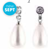
new SEPT PRINCESS DROPS $109