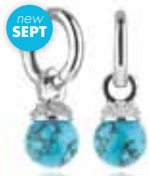
new SEPT TURQUOISE DROPS $109