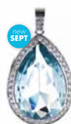
AQUA DROPLET large $169