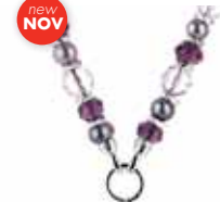
PARADISO LUXE standard $249