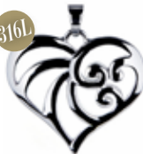
CHERISH medium $129