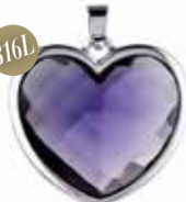
VIOLET LOYAL medium $129