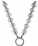
SILVER PEARL standard $189