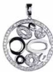
DIAMOND CONSTELLATION $159