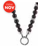
BLACK LUXE short $169