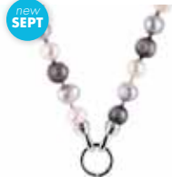
MULTI PEARL standard $199