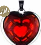
SCARLET HEART medium $129