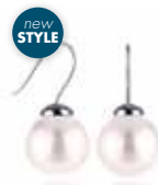
new STYLE CREAM HOOKS $59