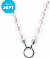
CREAM PEARL SHELL standard $159