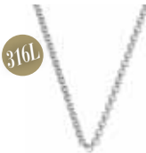
316L MINI STEEL ME long $149