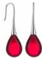
CHERRY OPERAS $99