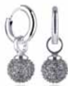
SPARKLE DROPS $129