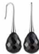
BLACK OPERAS $99