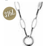
316L OVAL CHAIN long $169