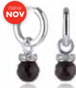
new NOV PETITE BLACK DROPS $89