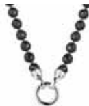
JET BLACK short $149 long $189