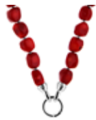
RED HOT standard $199 medium $229