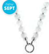
WHITE SATIN standard $169