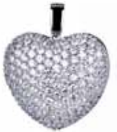
SPARKLE FOREVER medium $169 *Cubic Zirconia