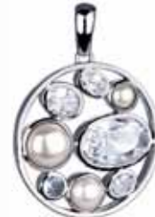
PEARL CONSTELLATION $149