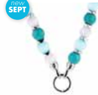
AQUATICA LUXE standard $249