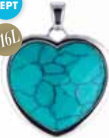
TURQUOISE LOYAL medium $129