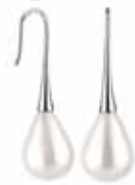
CREAM OPERAS $99