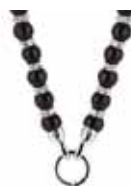
BLACK LUXE standard $199 medium $229