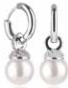
CREAM DROPS $109

*All drop earrings are encrusted with hand-set Cubic Zirconias.