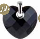
BRAVEHEART medium $119