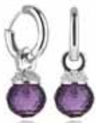
VIOLET DROPS $109