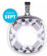
DREAMCATCHER medium $139 *Cubic Zirconia