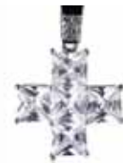
THERESA medium $119 *Cubic Zirconia