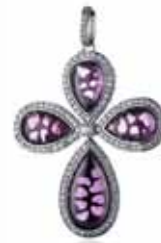
VIOLET PRIMROSE $179