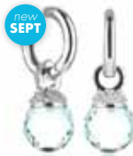
new SEPT AQUA DROPS $109