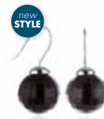
new STYLE BLACK HOOKS $59