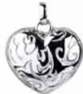
HEART NOUVEAU medium $129