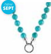
TURQUOISE standard $179