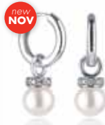
new NOV PETITE CREAM DROPS $89