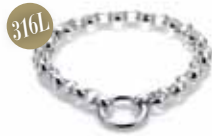
316L STEEL ME medium $119 large $129