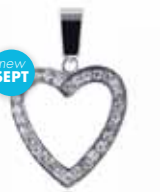
CUPID medium $109 *Cubic Zirconia