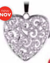
SPLENDOR $199 *Cubic Zirconia