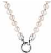
CREAM PEARL short $179, standard $189 medium $219