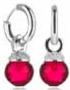
CHERRY DROPS $109